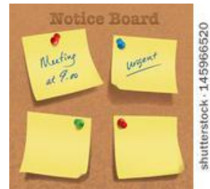
Public Service Bulletin Board

COLLECTION FOR EASTERN EUROPEAN CHURCHES: this annual diocesan collection will be held Sat.-Sun., August 26-27. As always, we ask your support, not only with your treasure, but also your charity of prayer.